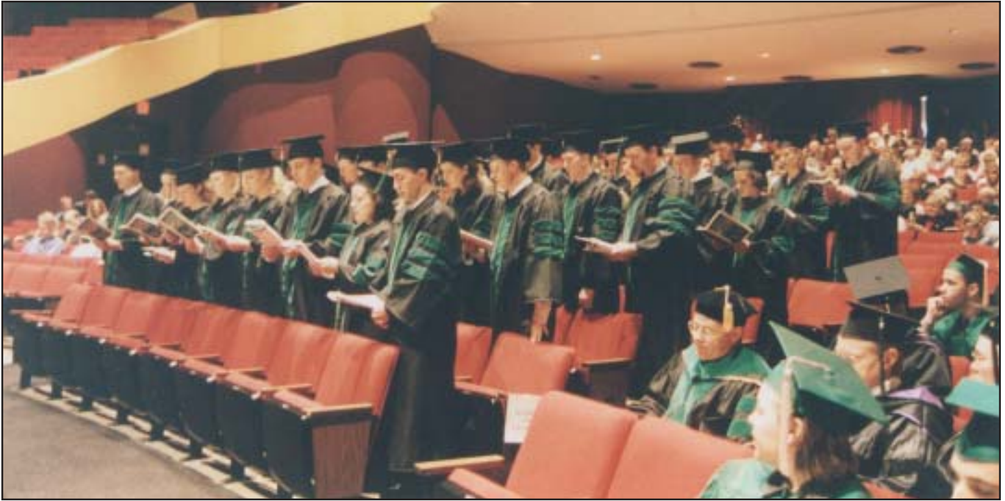
Members of the Class of 2002 pledge the Oath of Hippocrates during the commencement ceremony.