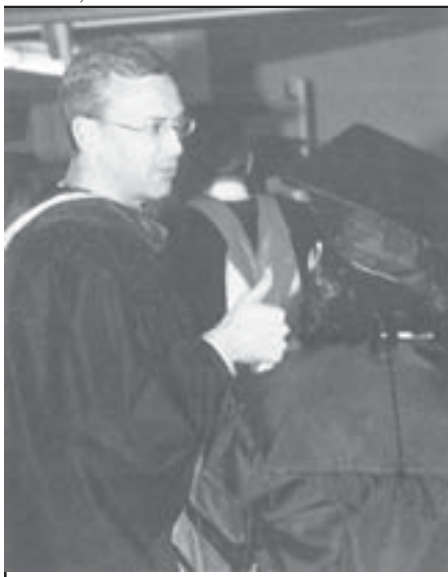
Keynote speaker Drew Pinsky, M.D., with a graduate

Fargo, North Dakota University of North Dakota, B.S., M.S. Family Practice Residency Duluth Graduate Medical Education Program Duluth, Minnesota